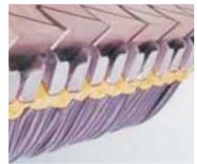
Carbonex's acid resistant insulation achieves a significantly longer product life than ordinary solutions