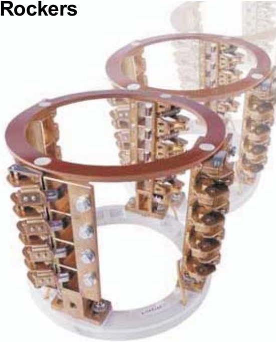
Carbonex brush rockers ensure good contact of the brushes to the collector

Customized and specialized products are no problem for us either. Operators and manufacturers of electrical machines know that they can count on Carbonex, and that they will also be able to continue doing so in future.