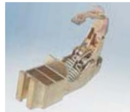
Tandem brush holders guarantee excellent commutation