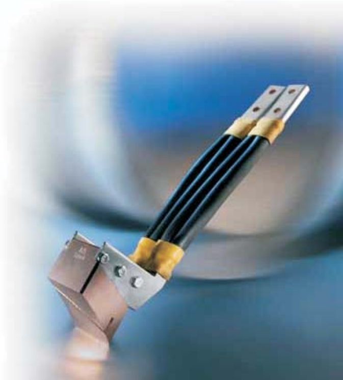
Carbon brush with a diagonal unning surface slot and outstanding current transmission properties

In the field of current transmission, we work as active development partners. In many projects we are able to implement our special materials know-how at an early stage, to the benefit of our customers. By working intensively together with our customers, we ensure a high degree of efficiency and customer satisfaction. We constantly strive to lengthen the usable lifetime of our products, as well as to minimize machine down time and reduce operating costs.