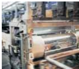
Coating companies rely on high quality Carbonex products for aluminum anodizing