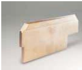
Small current collector by Carbonex: Precision in current transmission to mobile power consumers