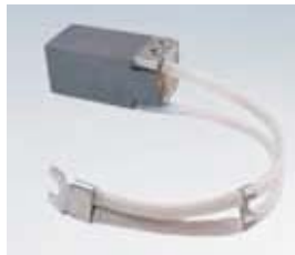
Industrial carbon brushes: Top quality and long life