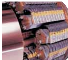
Carbonex carbon brushes provide a current transmission of more than 40,000 amperes